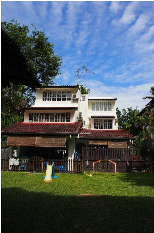
The spacious grounds of our Kheam Hock Rd campus..