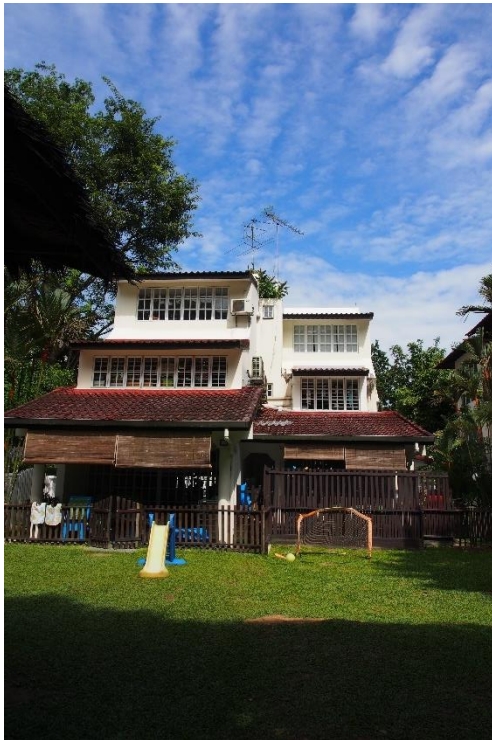
The spacious grounds of our Kheam Hock Rd campus..